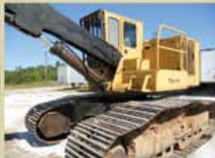
99 Tigercat T235 $44,500