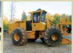
95 TC 726 'Fresh Eng'. $35,500

To see our full inventory, pictures, videos, specs and inspections please call or visit us online at; www.forestryfirst.com