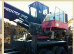
94 PR 210D w/Saw $22,500