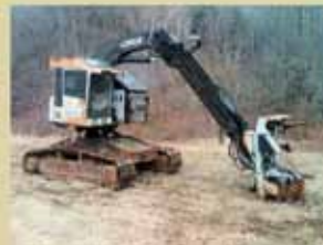
93 TI-425B 'Solid' - $44,900

Brian Nielson (Cell) 803.960.1613 | Jesse Sewell (Cell) 803.807.1726