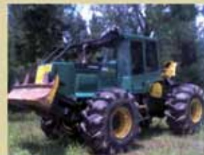
00 Timberjack 360C $44,900