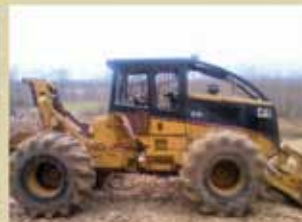
99 CAT 515 only 6100 hrs - Call